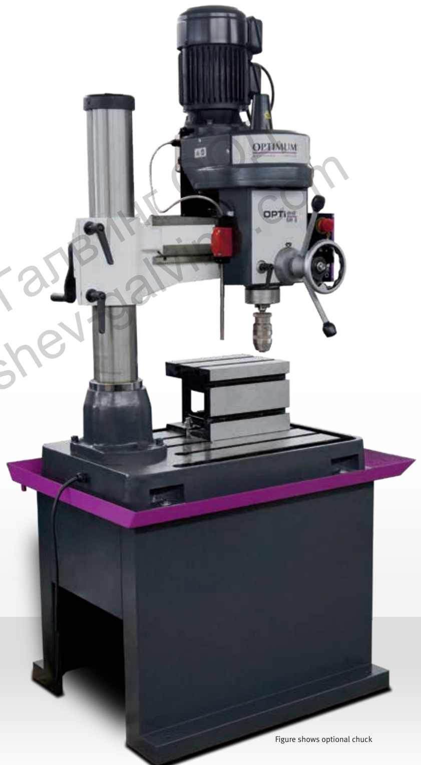
Figure shows optional chuck